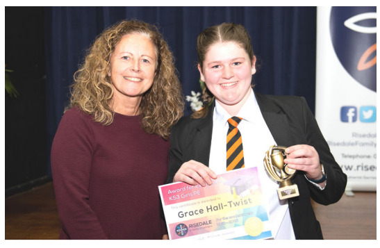
EXCELLENCE IN KS3 GIRLS PE

"I have played football all my life and went to see the [England women's team] finals at Wembley."